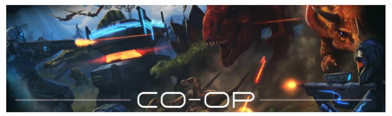
Supporting up to a variety of game modes, including: