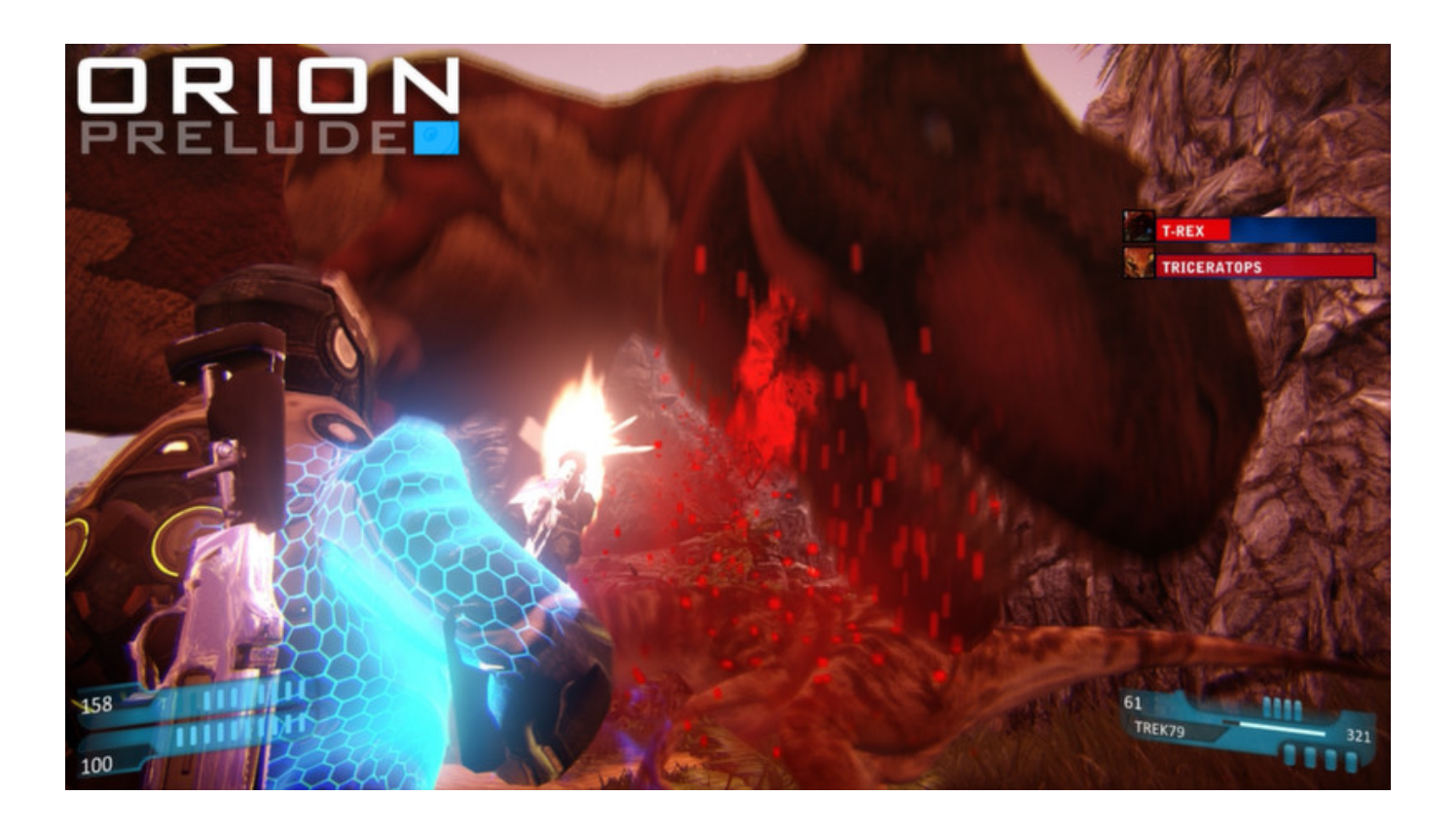
Download ->->-> <a href="http://bit.ly/2SLbwiC">http://bit.ly/2SLbwiC</a>

ORION: Prelude Torrent Download [Xforce]